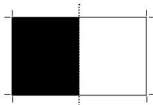
1/1 Page whole page 235 x 303 mm (+3 mm trim allowance)