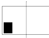
1/4 Page with frame 105 x 140 mm

Unique advertising formats upon request. The creation and layout of an advertisement can be provided by POLO+10 for a 120 EUR graphic design rate by the hour.