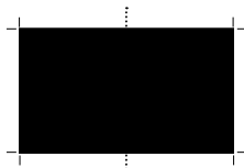
2/1 Page whole page 470 x 303 mm (+3 mm trim allowance)