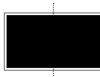
2/1 Page with frame 450 x 283 mm